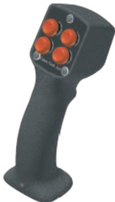
Product shown without cable harness for clarity