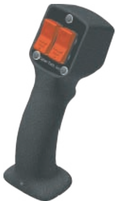
Product shown without cable harness for clarity