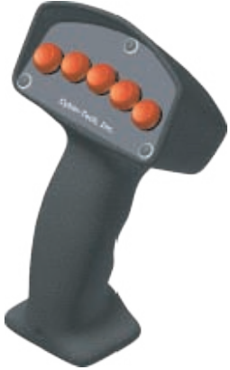
Product shown without cable harness for clarity