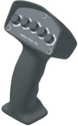
Product shown without cable harness for clarity