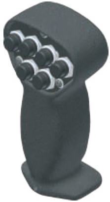
Product shown without cable harness for clarity