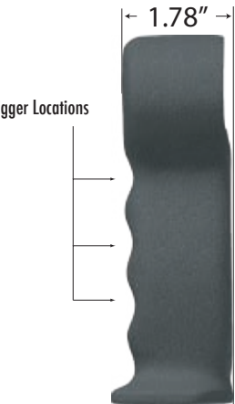
Product shown without switches for clarity