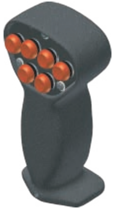
Product shown without cable harness for clarity