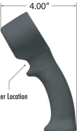
Product shown without switches for clarity