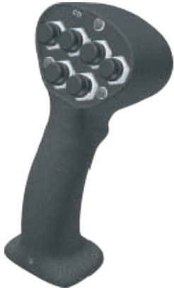
Product shown without cable harness for clarity