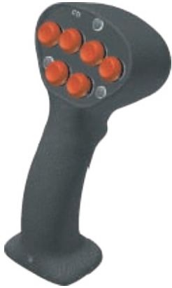
Product shown without cable harness for clarity