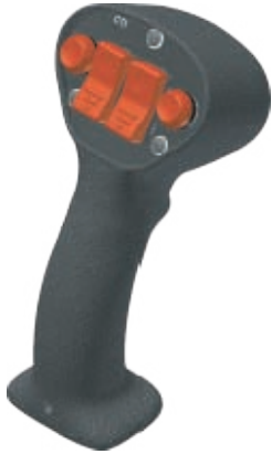
Product shown without cable harness for clarity