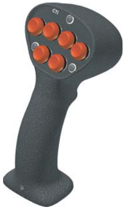
Product shown without cable

Control Handle Material: Aluminum Finish: Black Powder Coat Faceplate Material: Aluminum - 5052 Overlay Material: Polycarbonate Temperature Range: -55°C to +85°C at rated current CTI Switch Life Cycles: 10,000,000 Current Rating: 5 amps @ 30vDC