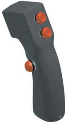
Product shown without cable harness for clarity