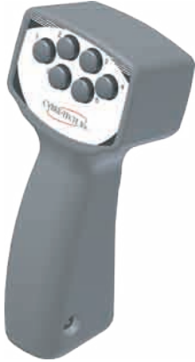
Product shown without cable harness for clarity