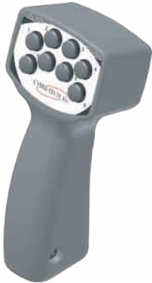
Product shown without cable harness for clarity