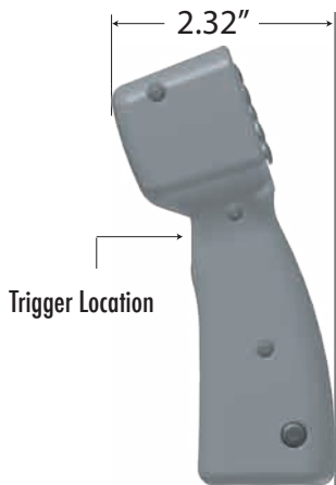
Product shown without switches for clarity