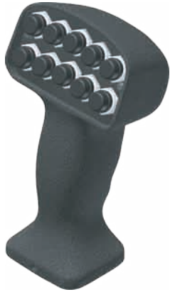
Product shown without cable harness for clarity