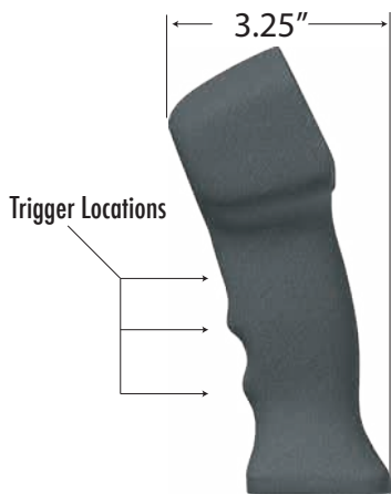
Product shown without switches for clarity