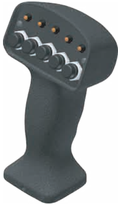
Product shown without cable harness for clarity