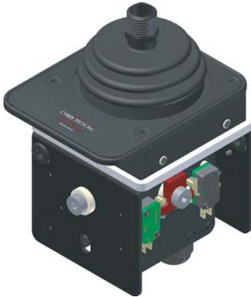
Product shown without cable harness for clarity

Dual Axis Contact Joystick With Single 10K Potentiometer + 1/2 NPT Adaptor