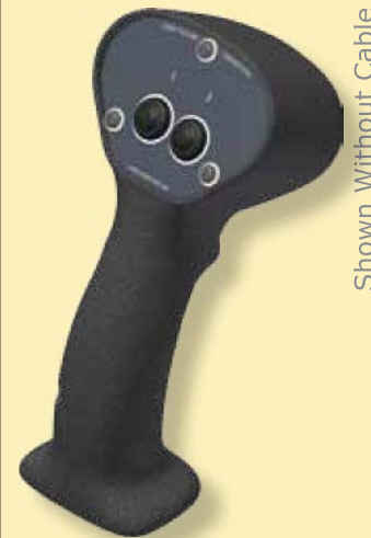
Shown Without Cable