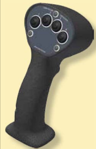
Shown Without Cable