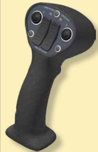
Shown Without Cable

Part Number CTI-2022690 2 Rockers + 2 Pushbuttons